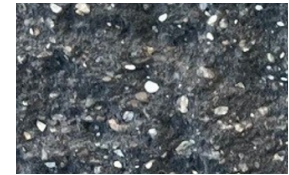
Parish Grey Blend Grey, Black C825 PG