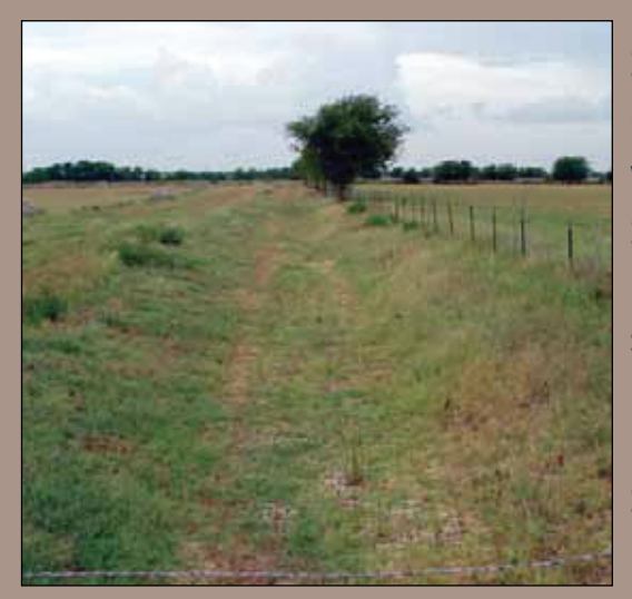
SHORELOC® PROMOTES A MORE COMPLETE NATIVE REVEGETATION THAN TYPICAL REVETMENT SYSTEMS

SHORELOC® not only provides more immediate ground cover, independent testing also proves SHOREBLOCK® provides better long-term control through more reliable and denser materials.